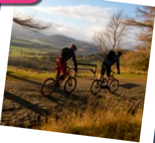
Biking at Glentress