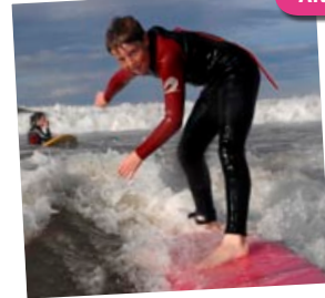
surfing at Belhaven Bay