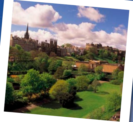
Princes Street Gardens

From vibrant city walks to adrenaline-charged activities, the capital has a vast and unique range of ways to bring your holiday to life. To sum it up in just a few words, Edinburgh has it all and more.